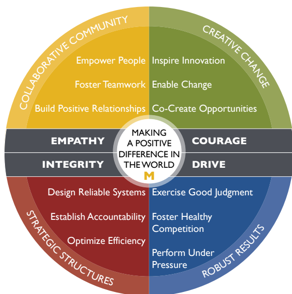
Figure 1: The Michigan Model of Leadership

To be clear, we make several assumptions about leadership in the 21 st century. First, leadership is not defined as a position or title. Instead, it is a set of actions that anyone can engage in regardless of where they sit in an organisational hierarchy.